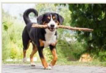
1. Sense of purpose

This is the longest and the most important section of the program as clear goals and intentions are essential for moving forward.